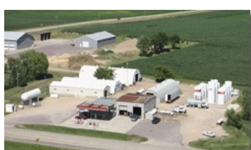
KLOSSNER ENERGY CENTER