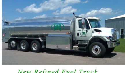
New Refined Fuel Truck

The information contained herein is accurate to the best of our knowledge and belief. This report and any views expressed herein are provided for information purposes only and should not be construed in any way as an inducement to buy or sell. UFC does not accept any liability for any loss or damage howsoever caused to anyone trading in reliance upon such information. Any prices indicated are subject to change with market conditions.